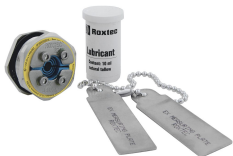
C RS T Ex seal